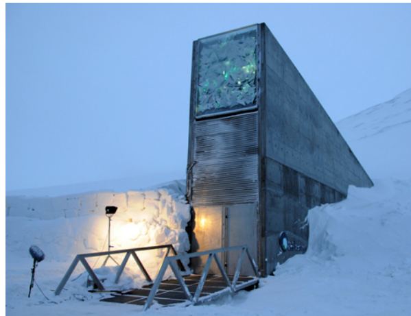
Figure 47.9 The Svalbard Global Seed Vault is a storage facility for seeds of Earth's diverse crops.

The Svalbard Global Seed Vault is located on Spitsbergen island in Norway, which has an arctic climate. Why might an arctic climate be good for seed storage?