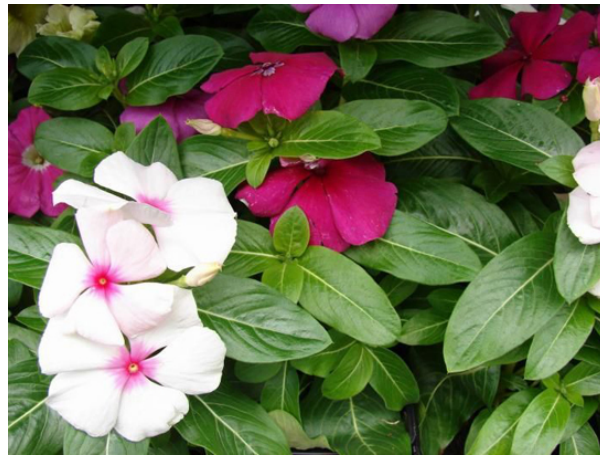
Figure 47.8 Catharanthus roseus , the Madagascar periwinkle, has various medicinal properties. Among other uses, it is a source of vincristine, a drug used in the treatment of lymphomas.

derived from plant compounds include aspirin, codeine, digoxin, atropine, and vincristine (Figure 47.8). Many medicines were once derived from plant extracts but are now synthesized. It is estimated that, at one time, 25 percent of modern drugs contained at least one plant extract. That number has probably decreased to about 10 percent as natural plant ingredients are replaced by synthetic versions. Antibiotics, which are responsible for extraordinary improvements in health and lifespans in developed countries, are compounds largely derived from fungi and bacteria.